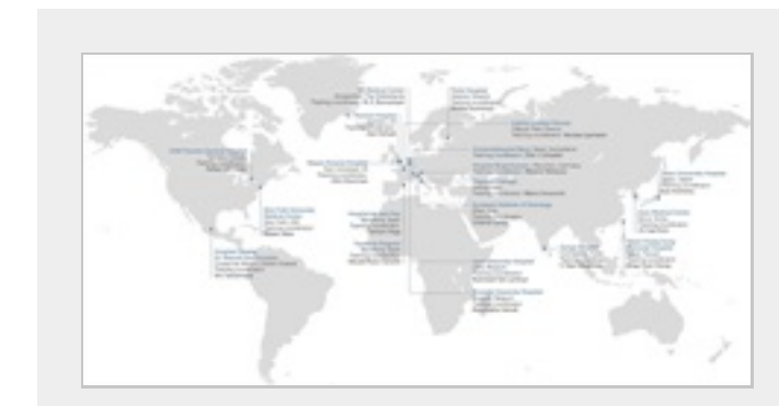
FIGURE 2: Microsurgery clinical departments in collaboration with European School of Reconstructive Microsurgery.

The first 10 modules are held at various locations in Europe; each module is held in a recognized center in the field that corresponds. The last module<sup>4</sup> is the longest period of training; it is a clinical immersion module and can be carried out at several possible microsurgery departments around the world such as Taipei Chang Gung Memorial Hospital (Taiwan), New York University Medical Center (United States), Queen Victoria Hospital (United Kingdom), Helsinki University Hospital (Finland), and Tokyo University Hospital (Japan) (Fig. 2).